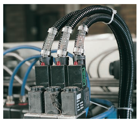
Use Weland marking tags on hydraulic hoses, pneumatic hoses and electric cables, and you get a distinct marking that will last for years.