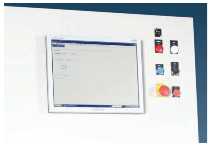
Easy to use. The monitor shows clearly what is happening and what choices you have.

The press is delivered with a tagcollector as standard.