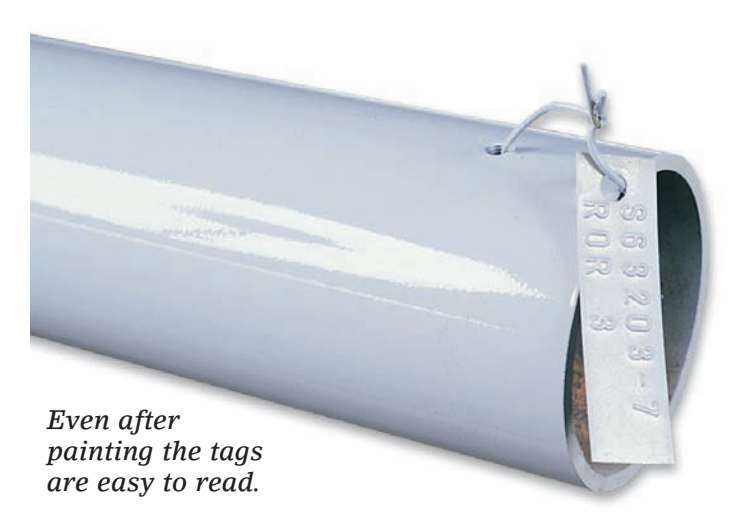
All types of poles can be marked with Weland marking tags.