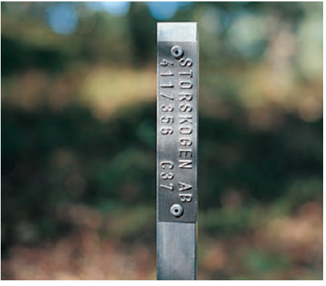
Marking of site boundaries with tags of stainless steel or aluminum is a durable solution.