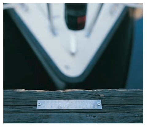
Mark your club's boat spaces with uniform and distinct name plates.