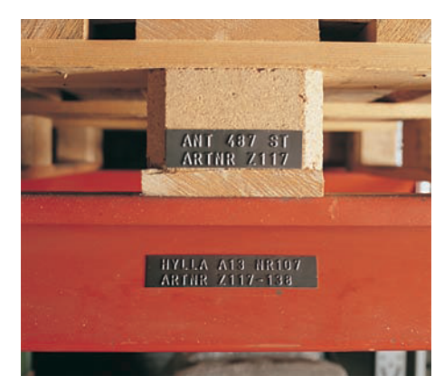
Use Weland marking tags in your magazine, you obtain distinct marking over many years.

Due to the fact that the tags are die sunk they are easy to read even after hot dip galvanizing, shotblasting or painting. Tags made of non-rusting material are always easy to read, even in dirty and aggressive environment.